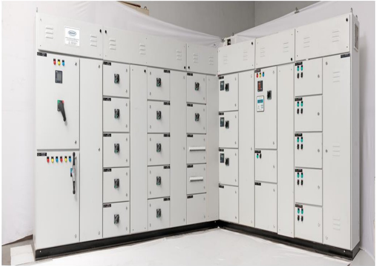
POWER DISTRIBUTION PANEL INSTALLATION