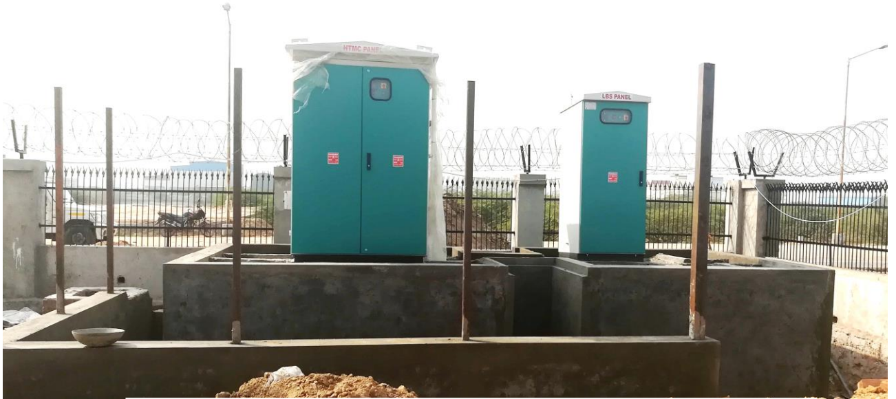
HT METERING CENTRE AND LBS INSTALLATION