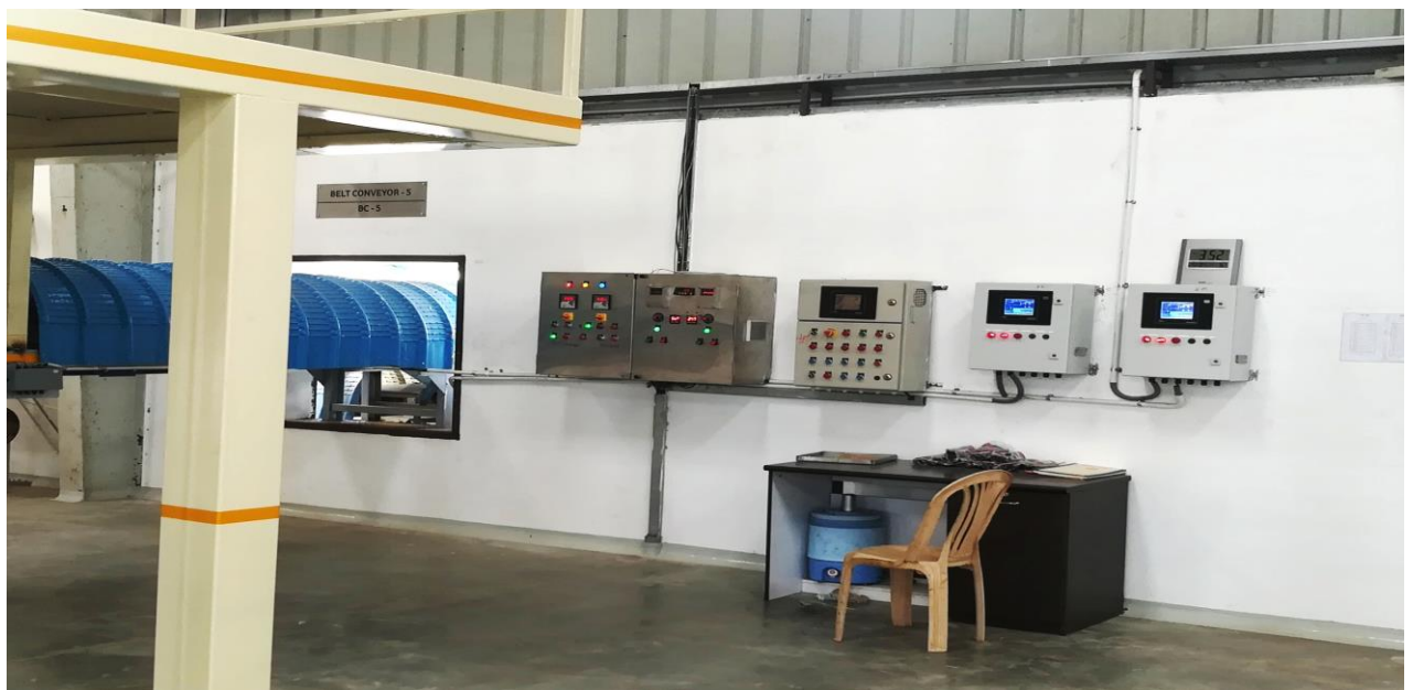
MACHINE CONTROL PANEL INSTALLATION