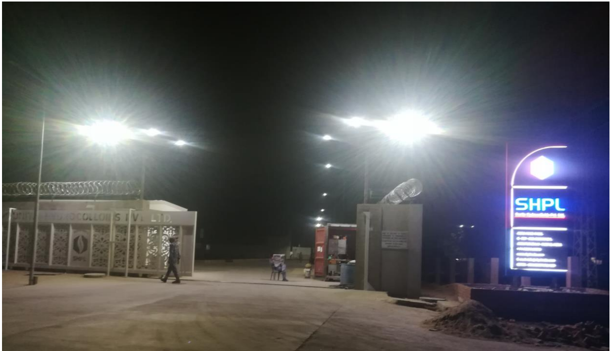
STREET LIGHT WORK