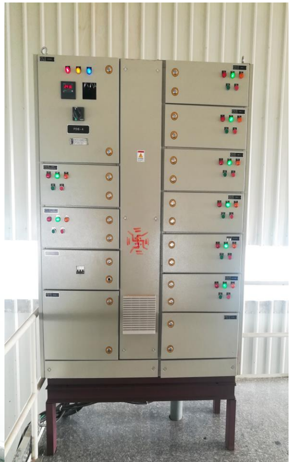
LT PANEL INSTALLATION