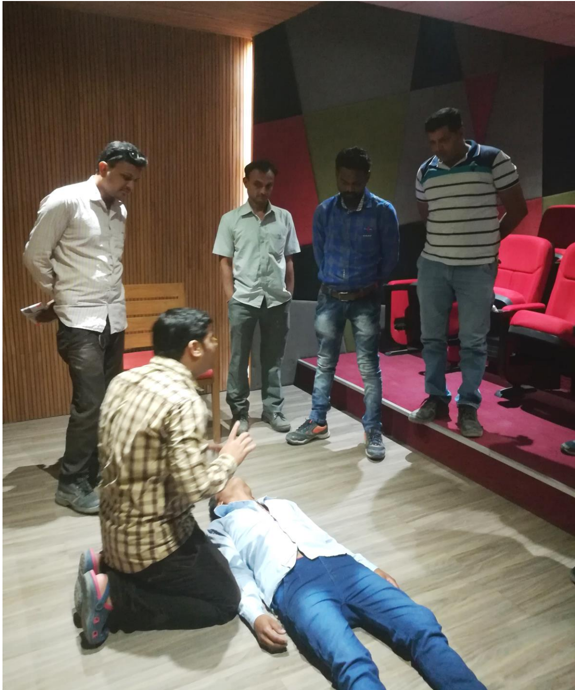
FIRST AID TRAINING