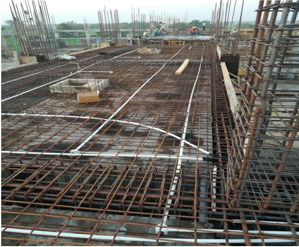
SLAB CONDUIT WORK