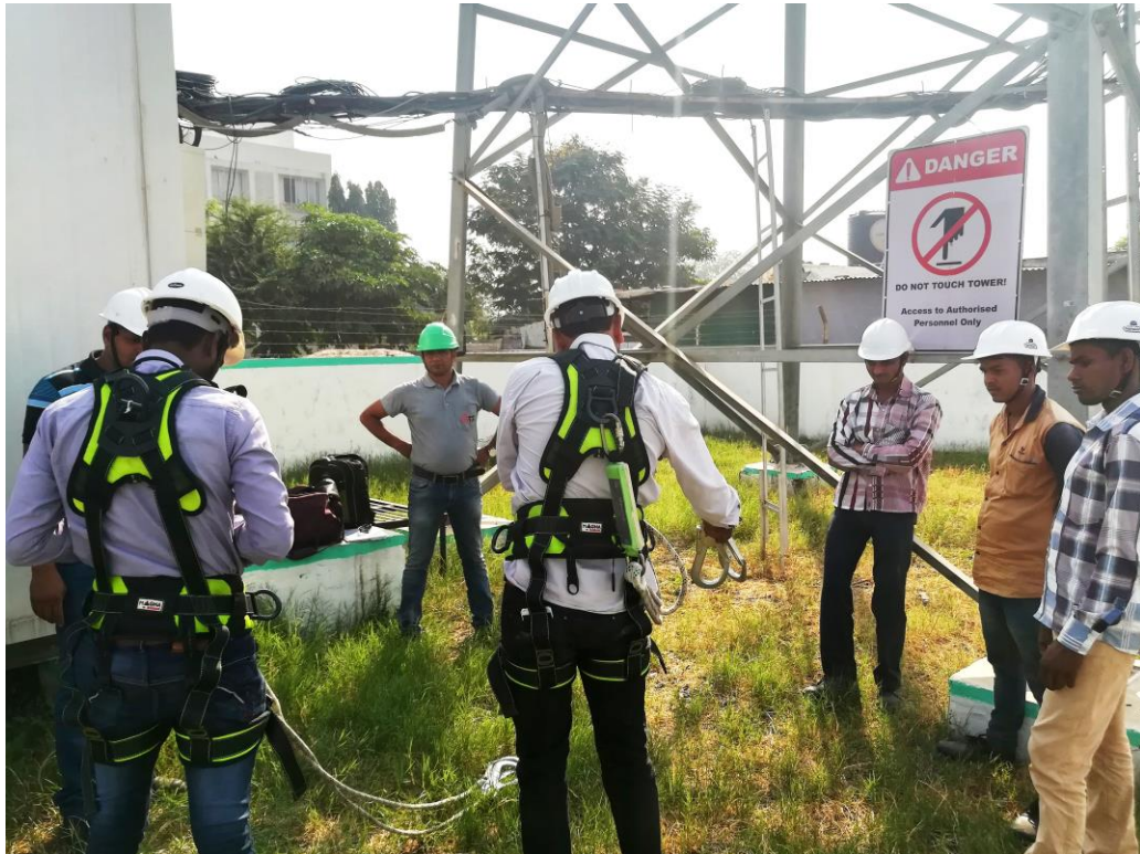
WORK AT HEIGHT TRAINING BY KARAM